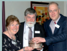
Chalicea, Tea Leaves, Artix